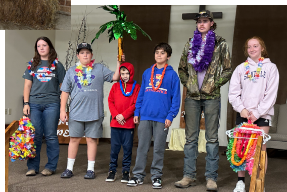
Achievement night decorating committee planning for achievement night with members from the Shunga Valley Club.